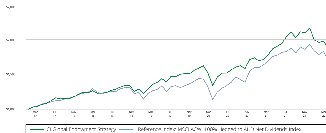
Cooper Investors Global Endowment Strategy – Gross of Fees and Expenses $1000 Invested Since Inception

The Cooper Investors Global Endowment Strategy predates the establishment of the Fund, however, the strategy has been in place for the Fund since inception.